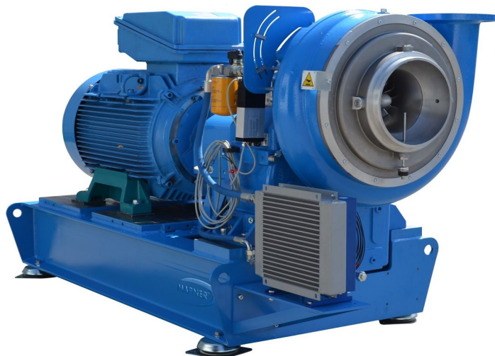
Shown model in B5 console configuration with flanged motor