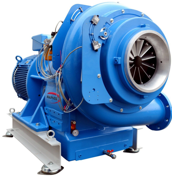
Shown model in B5 console configuration with flanged motor